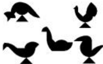
Figure 2: Tangram metaphor

This work was extended to consider how a more holistic approach to accessibility could be implemented beyond education, where theory and practice in e-learning as a means of enhancing traditional learning approaches had promoted a culture of collaborative, blended approaches to provision of information and experiences. The Tangram Model (see Figure 2 ) was developed to attempt to visualise the approach of using WCAG as one of a set of tools and techniques all aimed at using the Web as a tool to maximise access to information and services (Sloan et al 2006). Other such tools might include use of personalisation of delivery based on knowledge of a user's access requirements, as promoted by the IMS AccessForAll approach to accessibility (DCMI 2008), or even other, potentially more effective media streams to optimise accessibility for particular groups (Carey 2005).