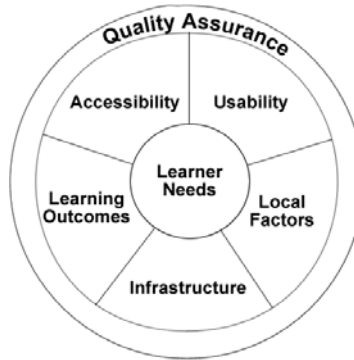
Figure 1: Holistic Accessibility

This work was extended to consider how a more holistic approach to accessibility could be implemented beyond education, where theory and practice in e-learning as a means of enhancing traditional learning approaches had promoted a culture of collaborative, blended approaches to provision of information and experiences. The Tangram Model (see Figure 2 ) was developed to attempt to visualise the approach of using WCAG as one of a set of tools and techniques all aimed at using the Web as a tool to maximise access to information and services (Sloan et al 2006). Other such tools might include use of personalisation of delivery based on knowledge of a user's access requirements, as promoted by the IMS AccessForAll approach to accessibility (DCMI 2008), or even other, potentially more effective media streams to optimise accessibility for particular groups (Carey 2005).