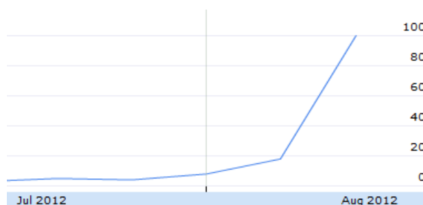
Figure 1: Google Insights searches for "app.net"

Figure 1 shows trends for searches for the string "app.net". As would be expected, the growth in searches began following the announcement of this development.