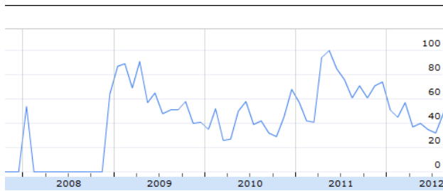
Figure 2: Google Insights searches for “diaspora.net”

It will be important to monitor other social media services which may have a significant role to play in supporting institutional needs. However the evidence to date, including the survey carried out in August 2012 which identified over a million Facebook ‘likes’ for UK Russell Group Universities [6] and the social media analytics survey of Twitter use by these institutions [7] suggests that institutional activities should be focused on developing best practice for these services rather than implementing alternative offerings.