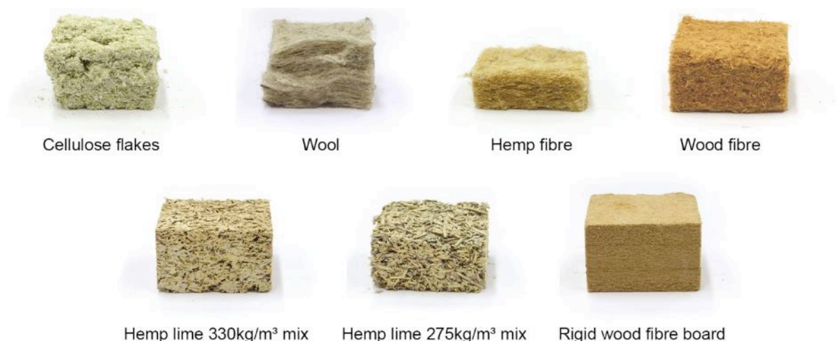
Figure 1: Insulation specimens.